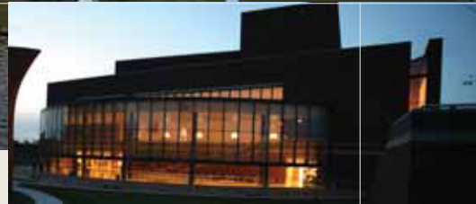
Blanche M. Touhill Performing Arts Center (PAC)