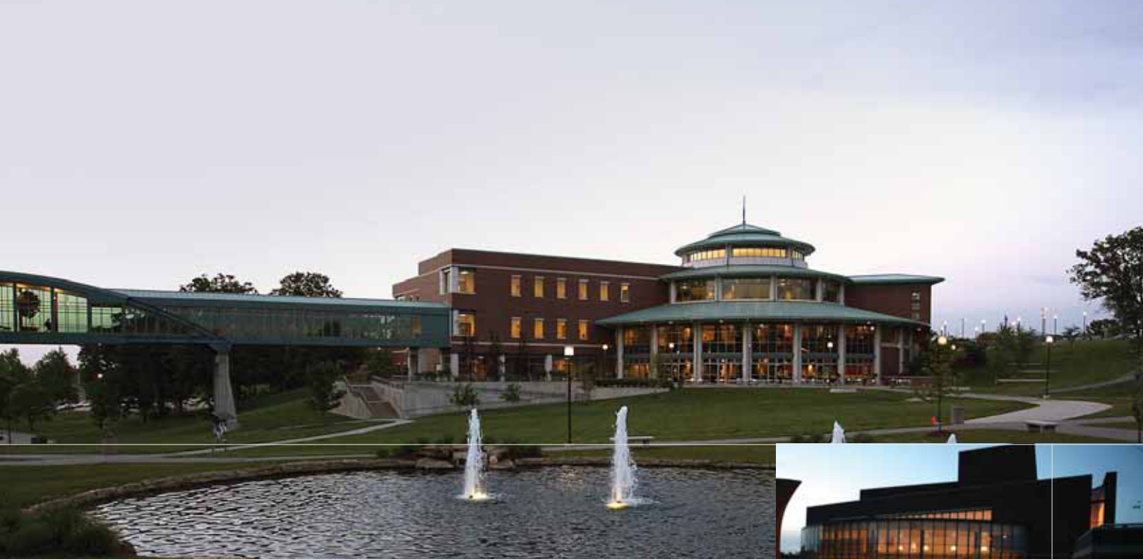
Millennium Student Center (MSC)